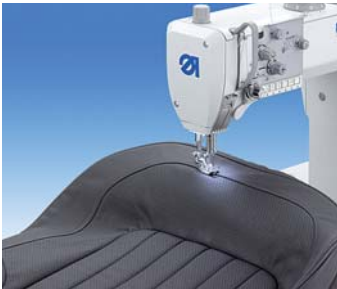
868-190322 CLASSIC Topstitching of felled seams with right-handed post bed for optimum handling in the production of car seat covers