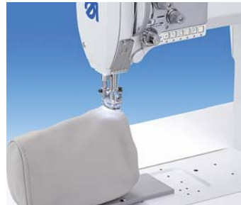
868-390322 CLASSIC Topstitching operations with left-handed post bed in narrow radii in the production of headrests