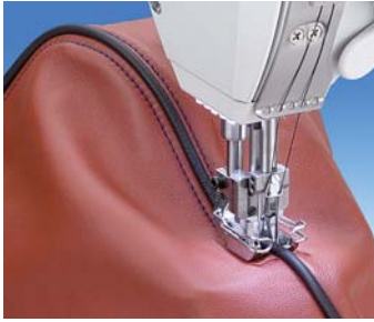
868-290322 CLASSIC Effective seam appearance and constant seam margins when sewing decorative welt seams