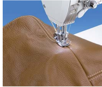
868-290322 CLASSIC Tight stitch formation and constant seam margins when topstitching furniture leather by means of sewing equipment with compensating foot and presser foot with integrated seam center guide