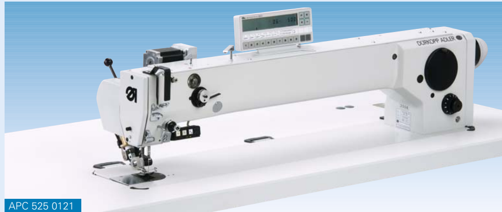
APC 525 0121