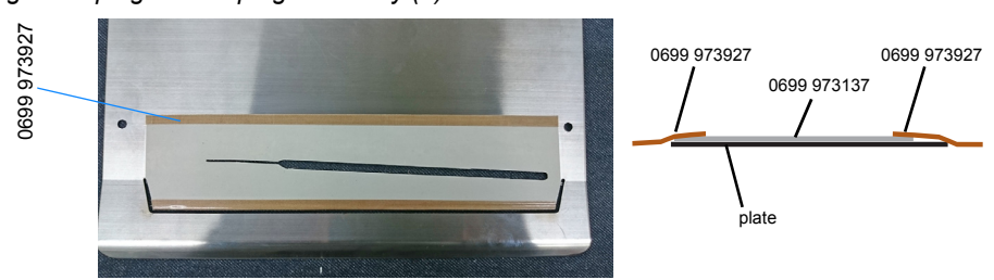
Fig. 3: Taping the shaping assembly (3)